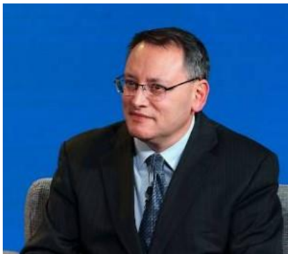
Dr Shane Reti National List MP, Whangarei