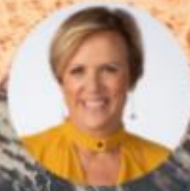
Hilary Barry, MC

27th - 29th October 2023 Rydges Lakeland Resort | Queenstown