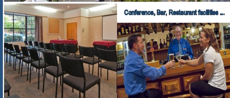
Conference, Bar, Restaurant facilities ...